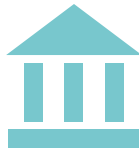
Agency Decision Makers