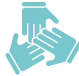
Key Community Partners

Local agricultural landowners, agency decision makers, and key community partners are vital. Become one, identify others, and define your common goals. This is important as a first step because bringing together a range of interests early on, will not only help with the coordination of the project but will allow a comprehensive community vision to take shape.